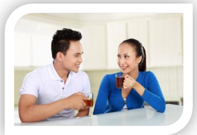
Talk to your partner about how you feel about sex.