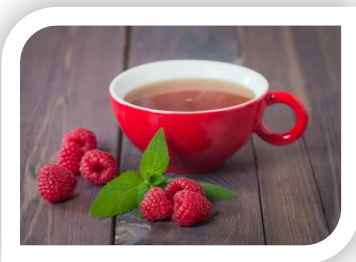
Red raspberry leaf tea can help with cramps.