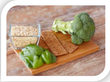
Eat foods that are high in fiber to prevent or ease constipation.